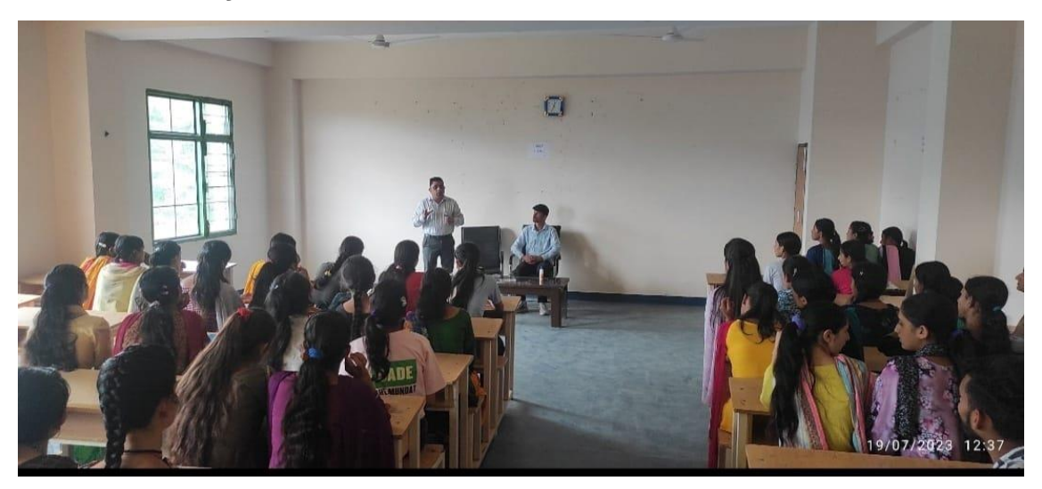
iv. Lecture by Ph.D. Scholar from HPU