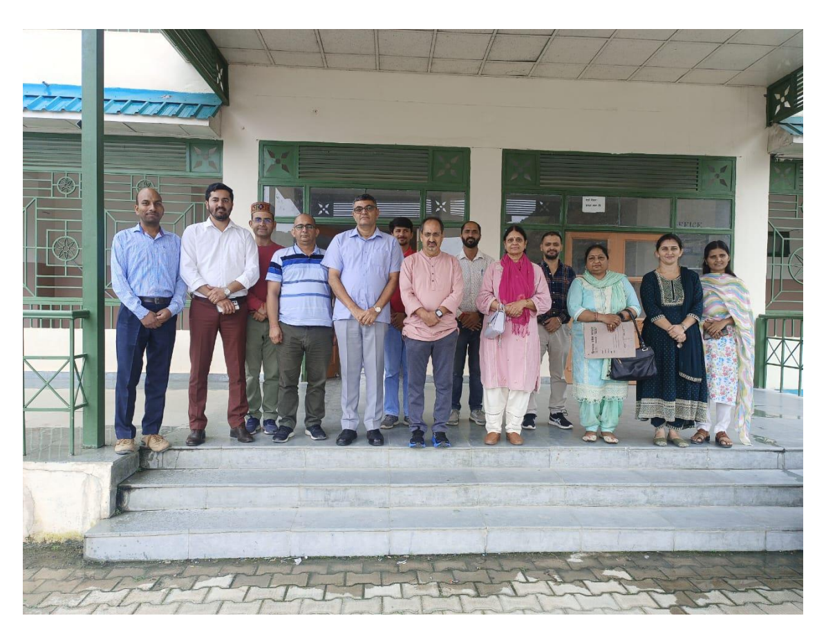
Figure 1: College Staff with Library Inspection Team