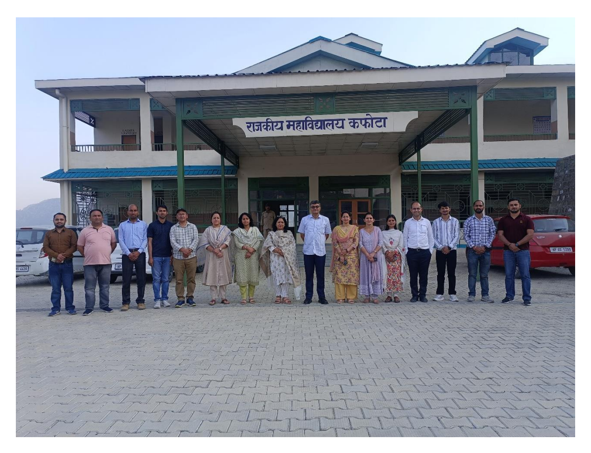
Figure 2: College Staff with University Inspection Team