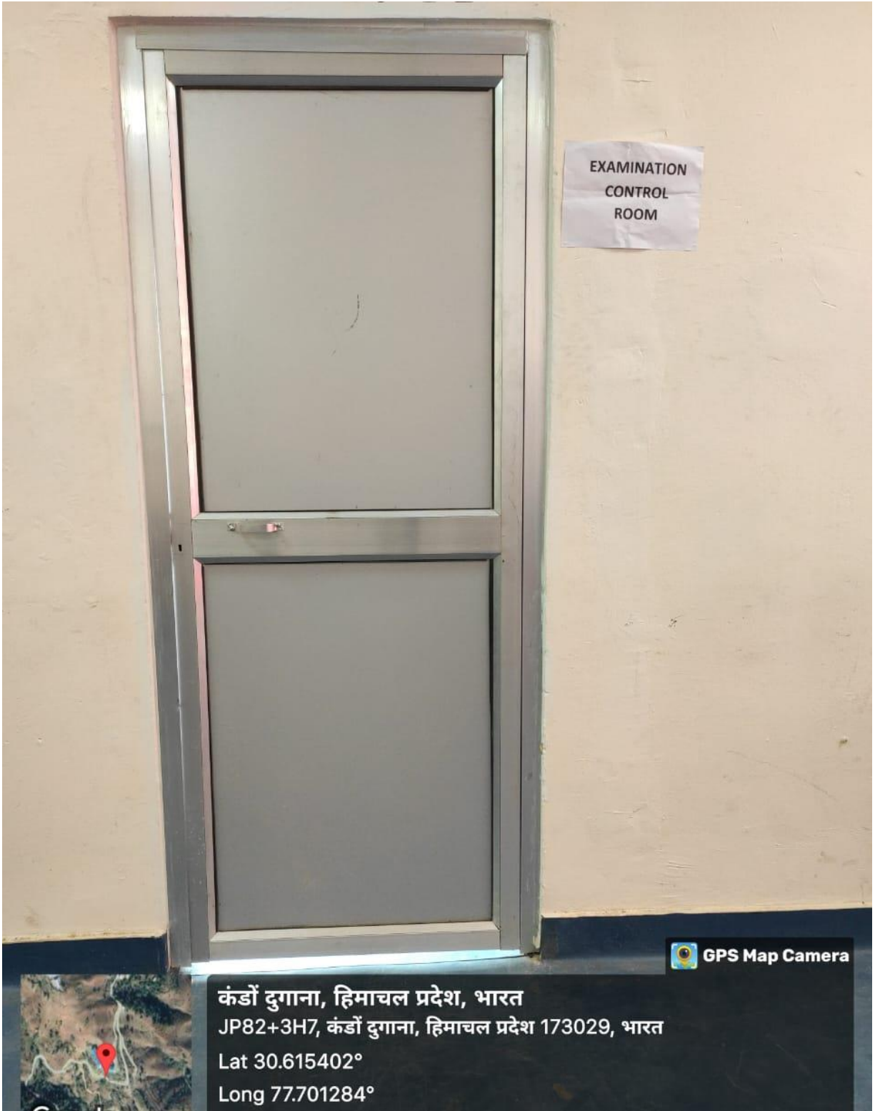
Figure 2: Examination Control Room (outside)