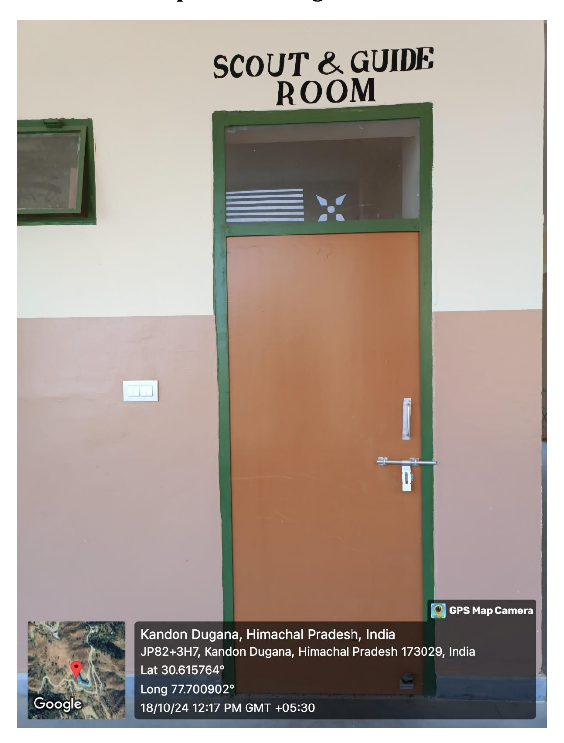
Figure 1: Rangers and Rovers Room (outside)