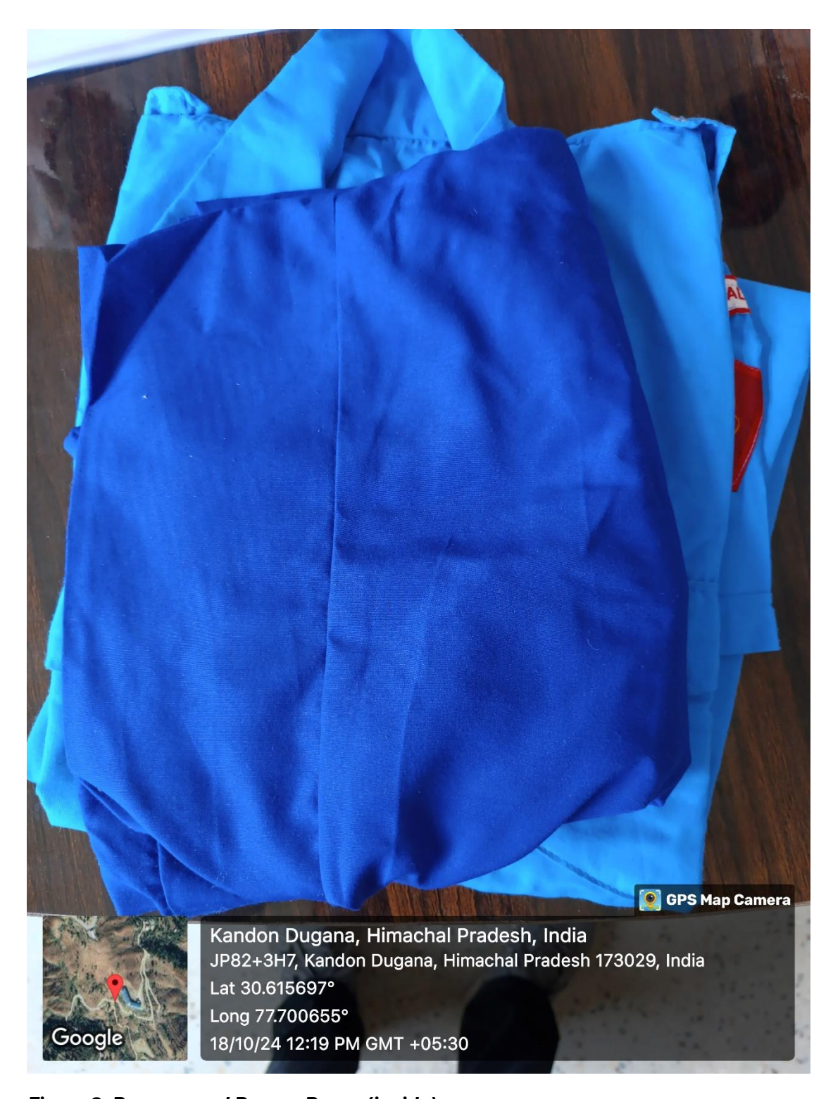
Figure 2: Rangers and Rovers Room (inside)