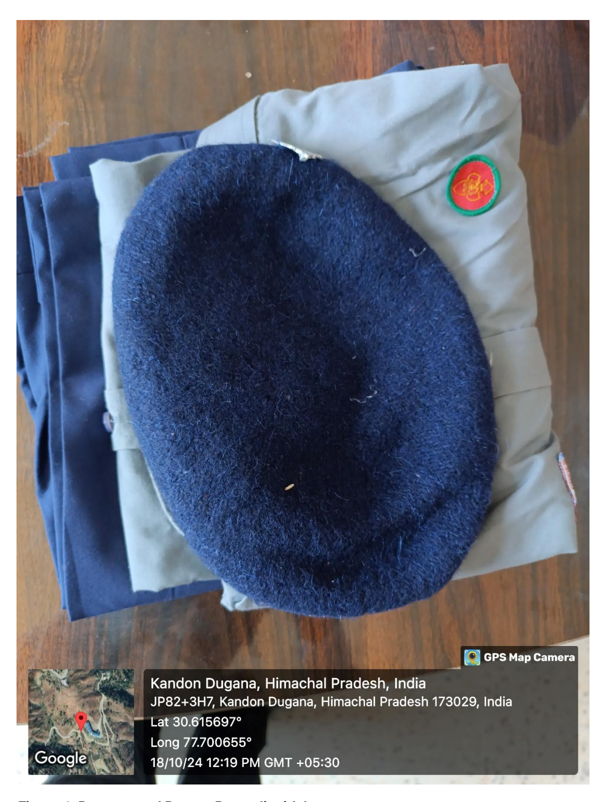
Figure 4: Rangers and Rovers Room (inside)