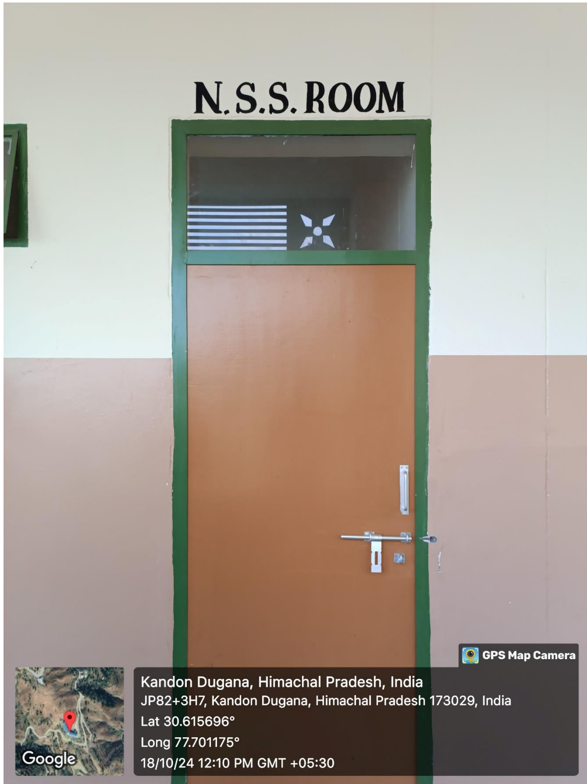
Figure 1: NSS Room (outside)