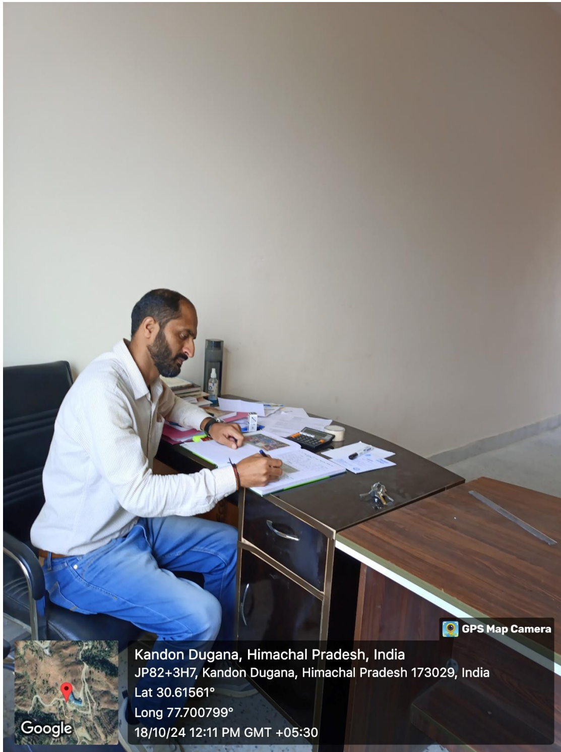
Figure 2: NSS Room (inside)