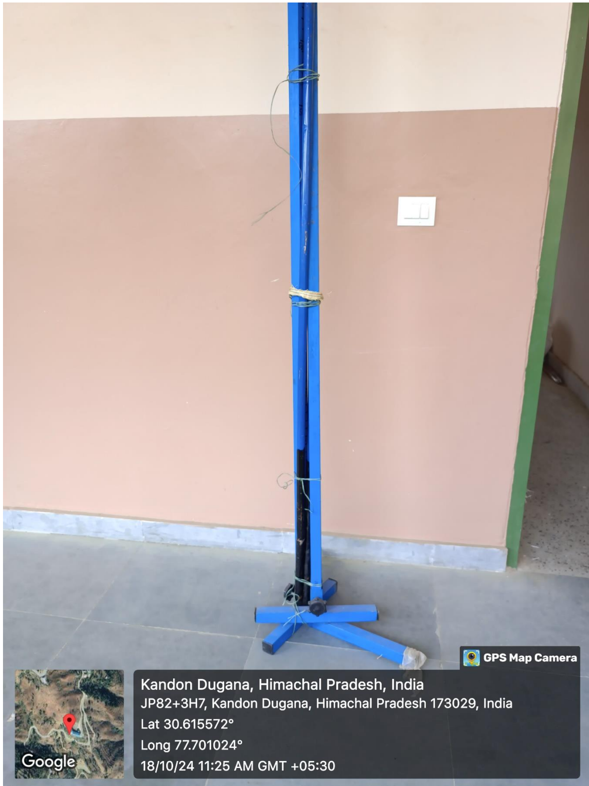
Figure 1: Long Jump