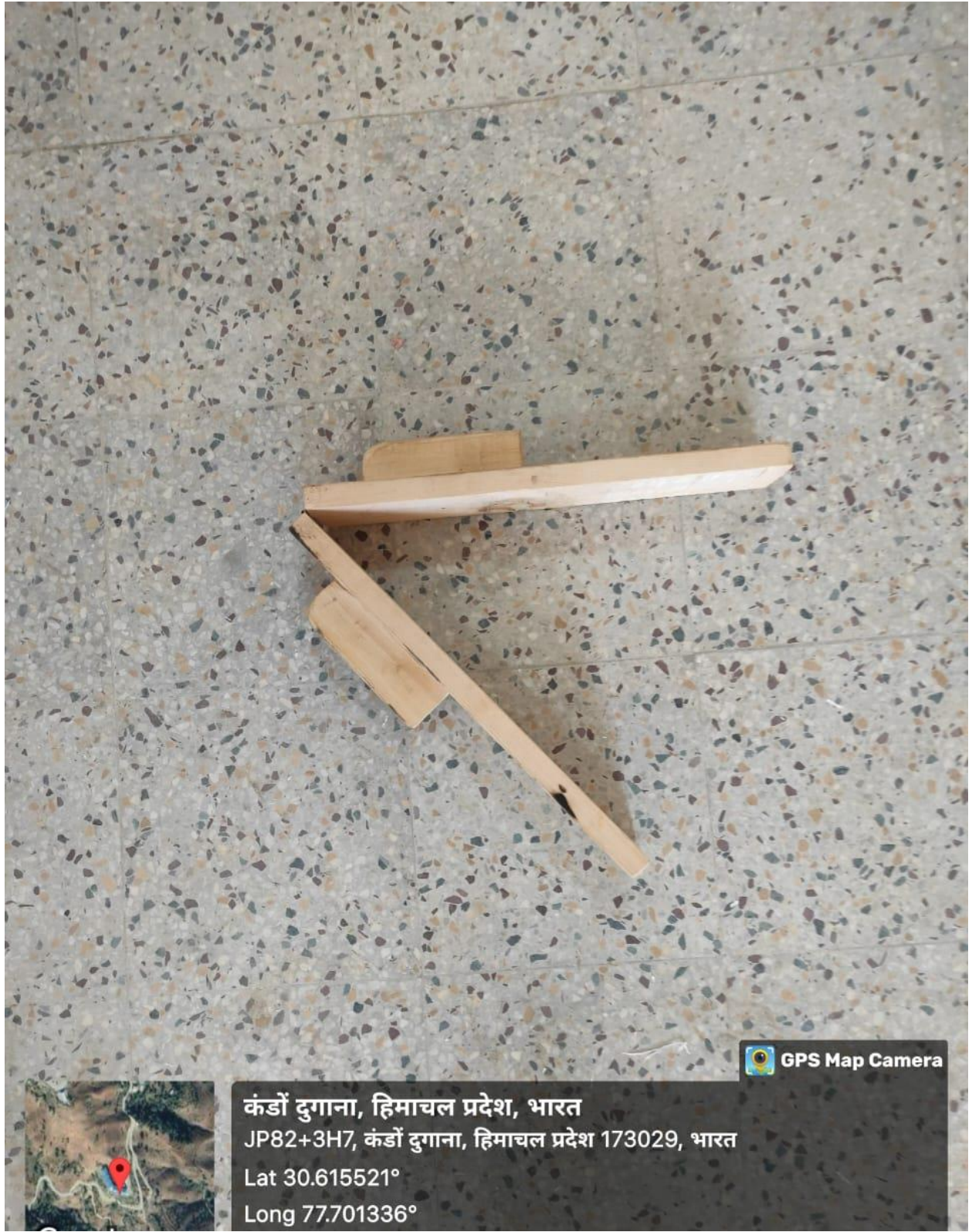
Figure 6: Clapper