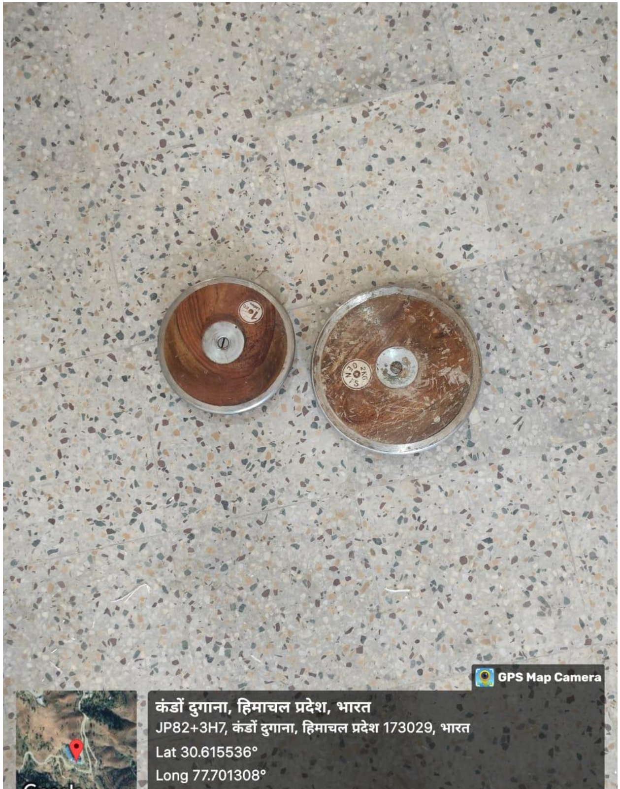
Figure 5: Discus