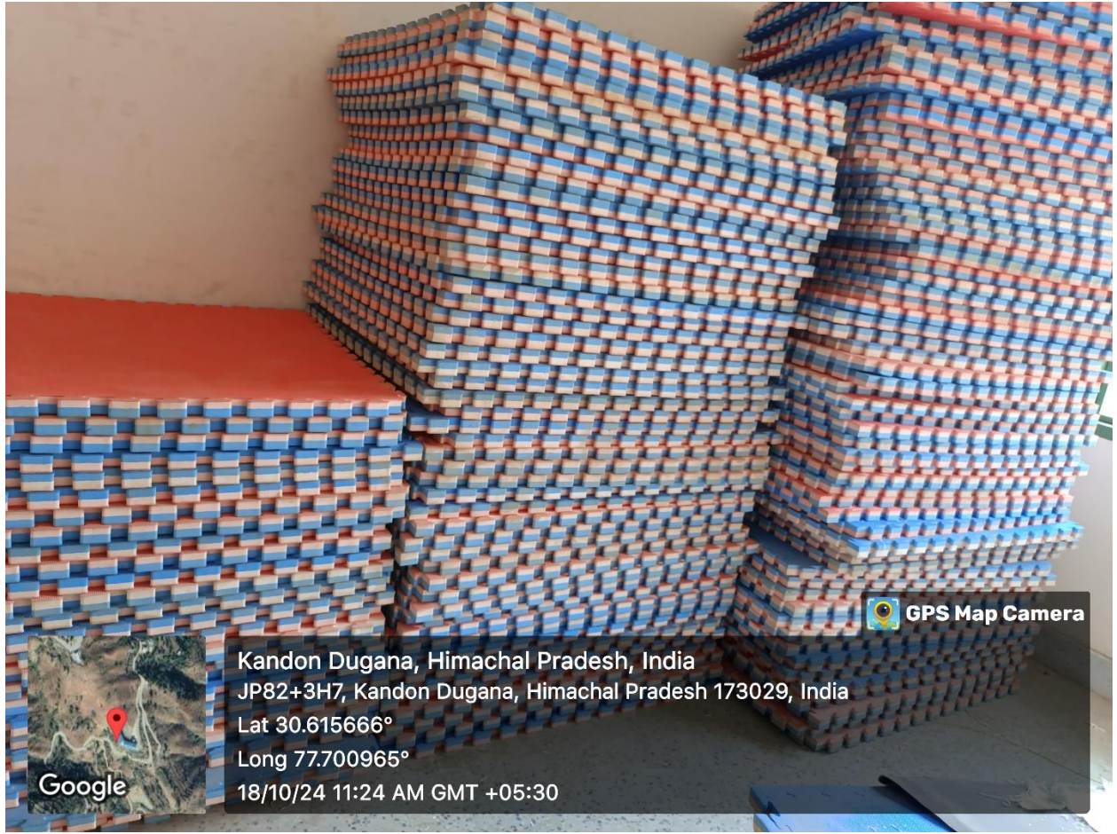
Figure 4: Kabbadi Mats