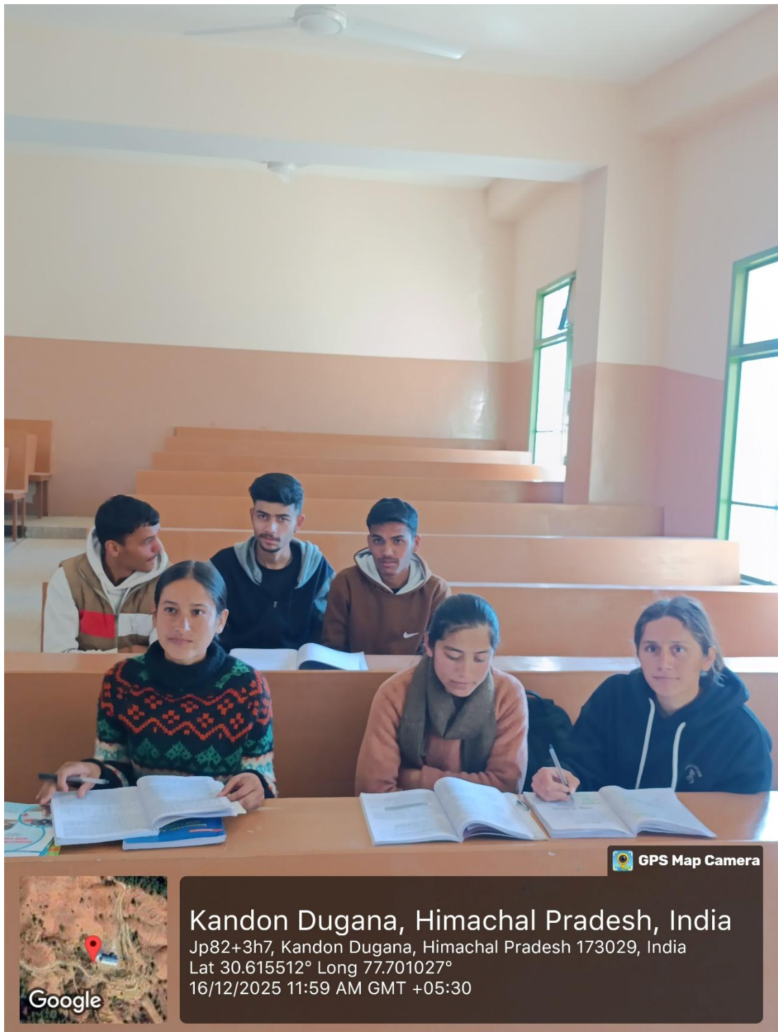
Figure 8: Lecture Hall 302 (Inside)