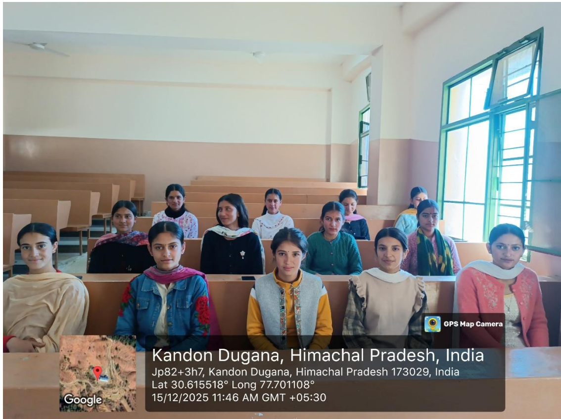
Figure 2: Lecture Hall 201(Inside)