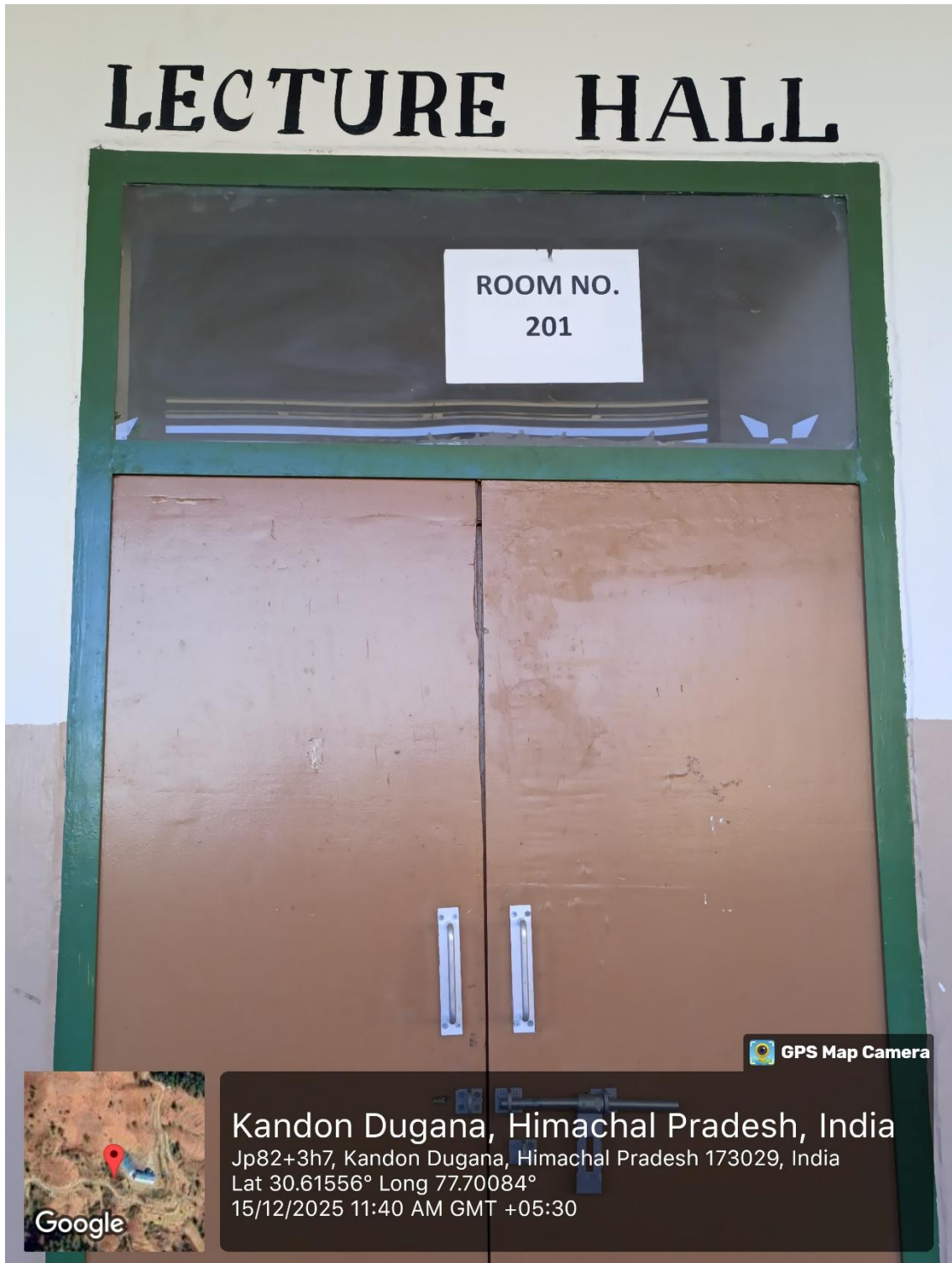
Figure 1: Lecture Hall 201 (Outside)