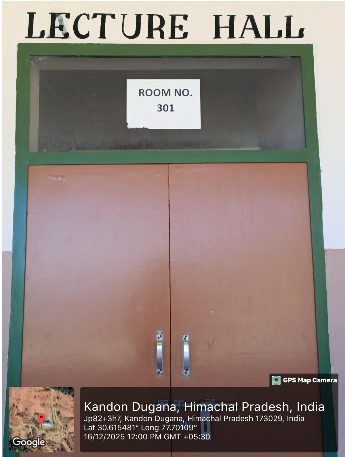
Figure 5: Lecture Hall 301 (Outside)