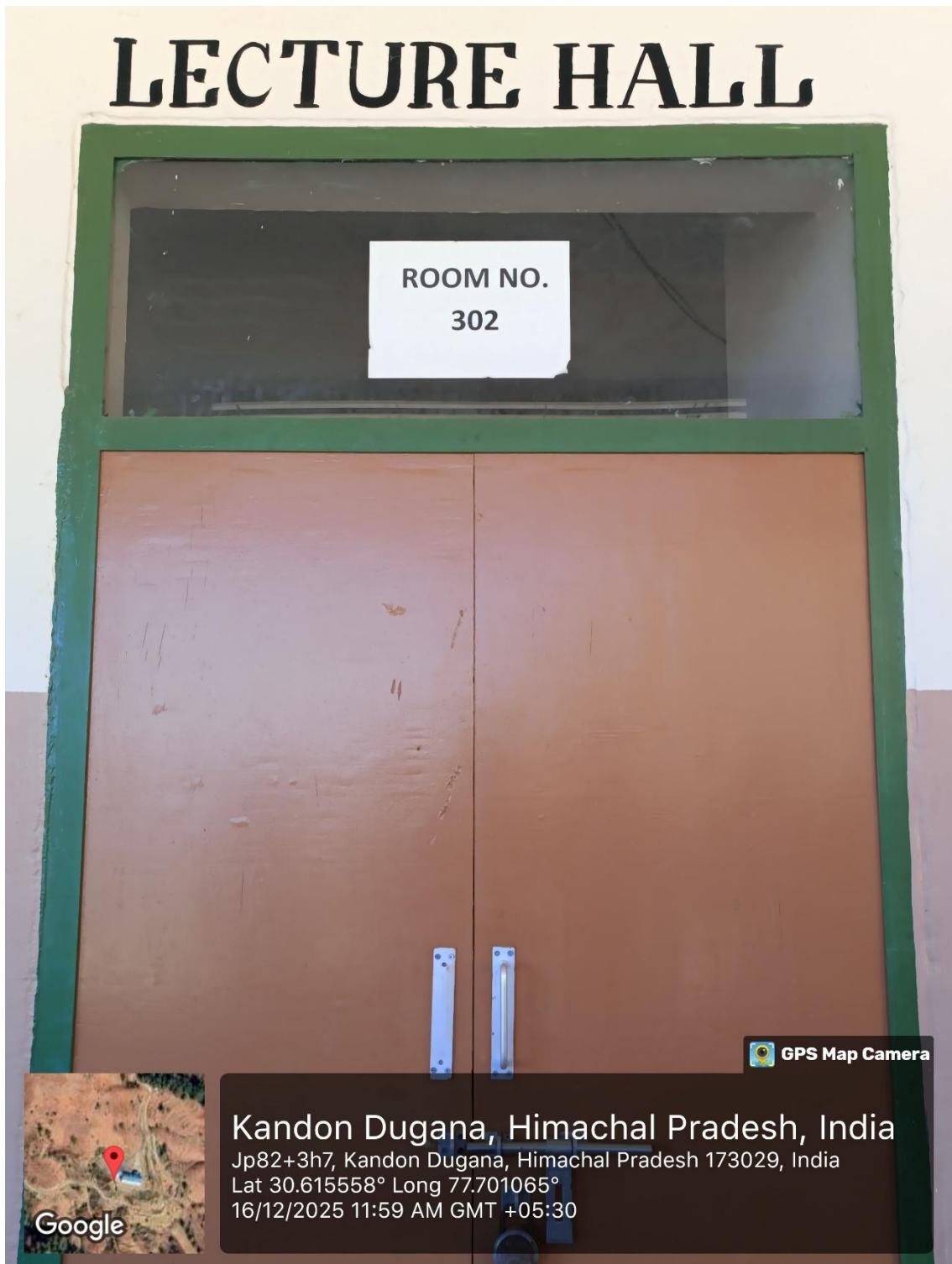
Figure 7: Lecture Hall 302 (Outside)