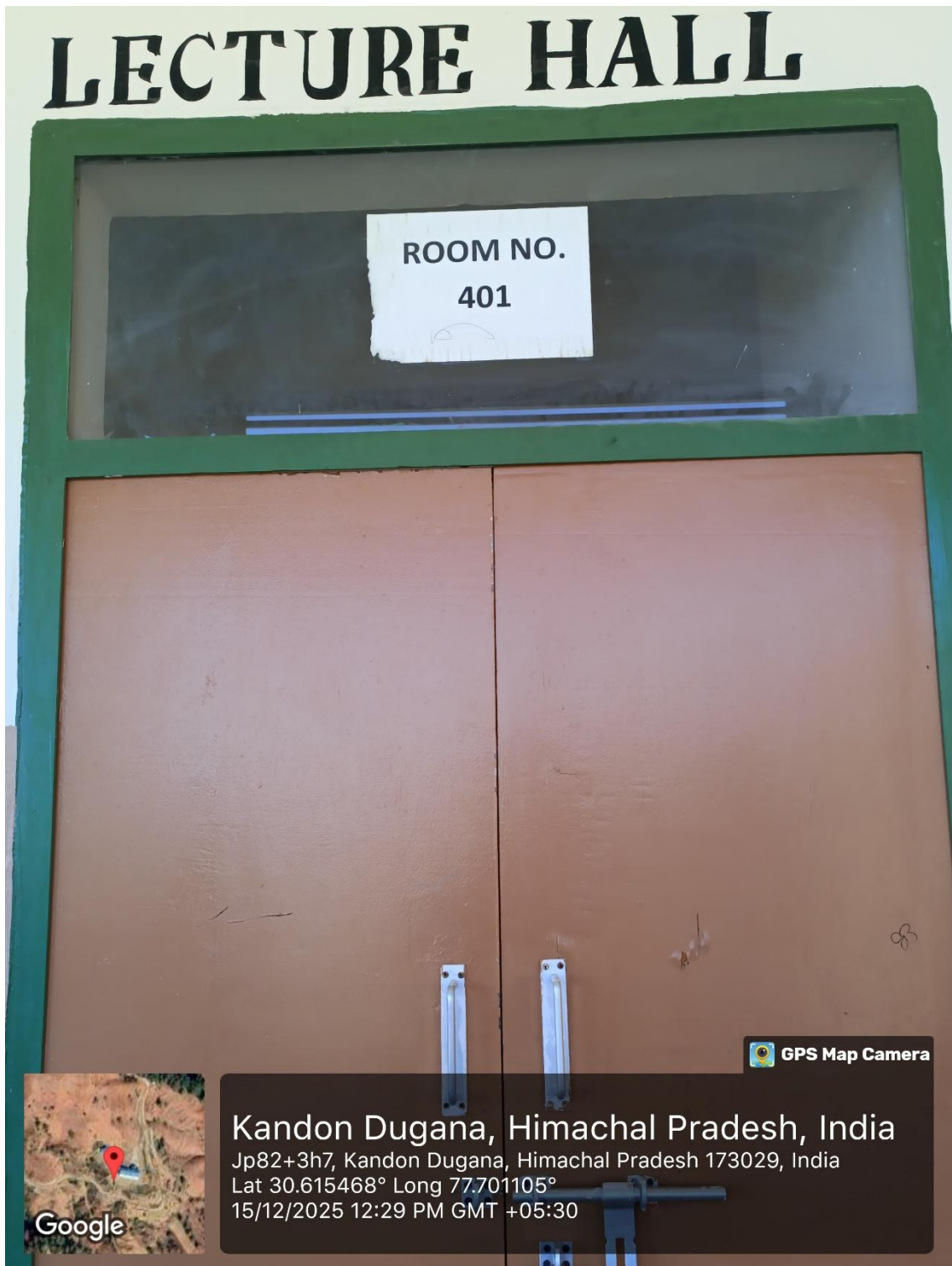
Figure 9: Lecture Hall 401 (Outside)