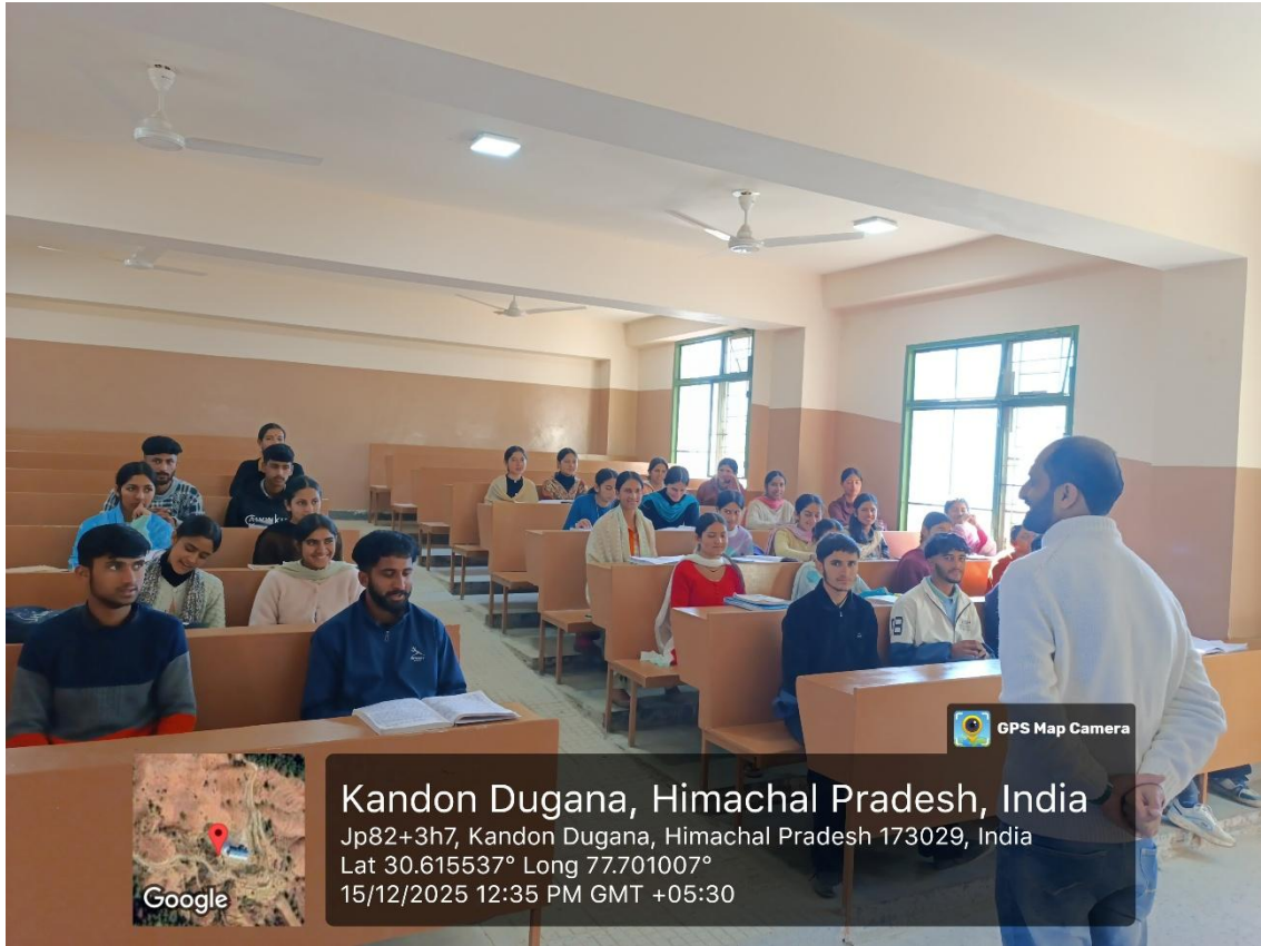
Figure 12: Lecture Hall 402 (Inside)