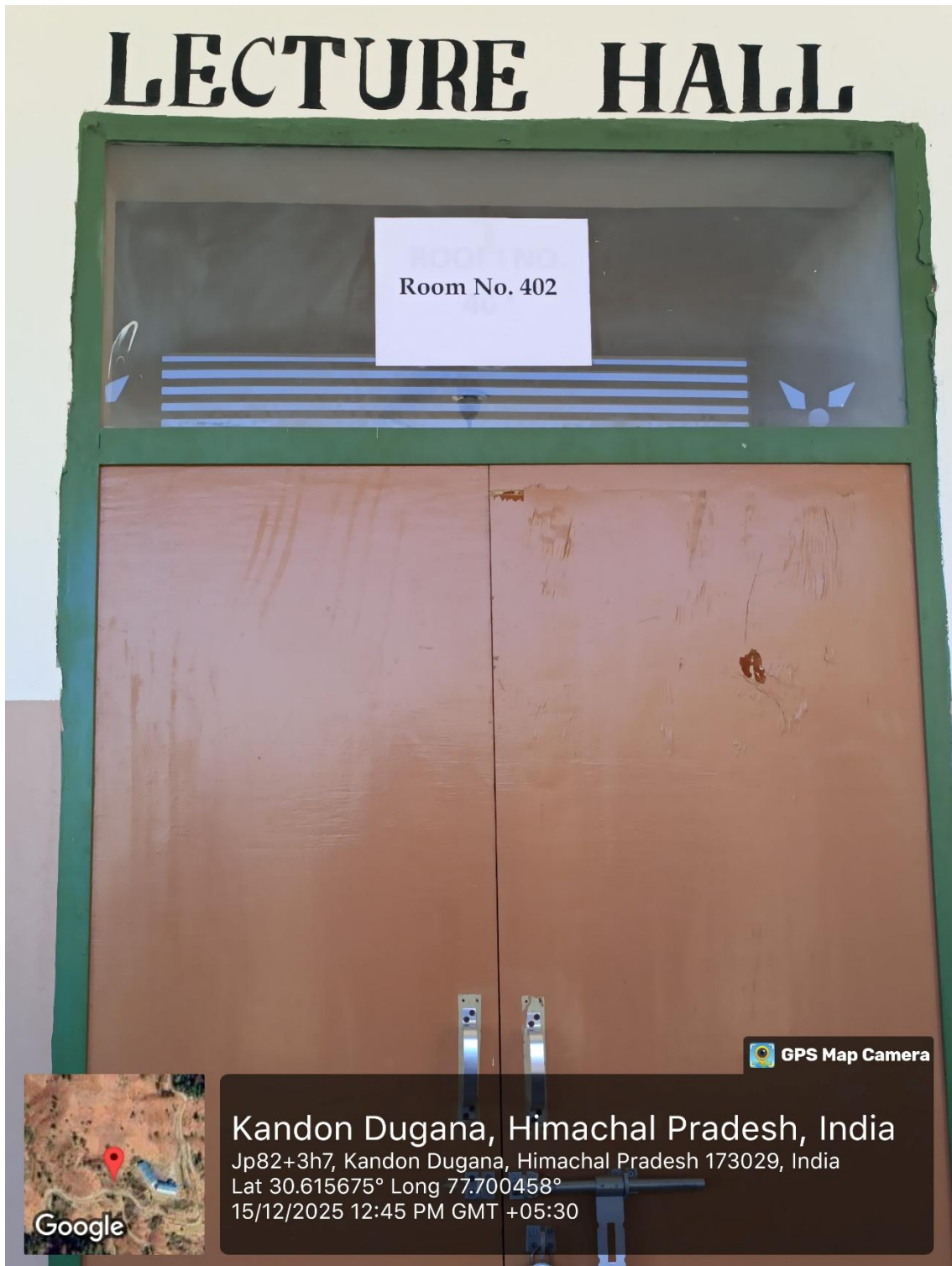
Figure 11: Lecture Hall 402 (Outside)