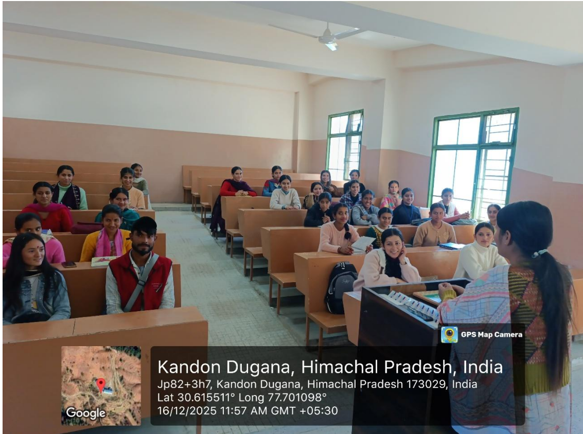
Figure 6: Lecture Hall 301 (Inside)