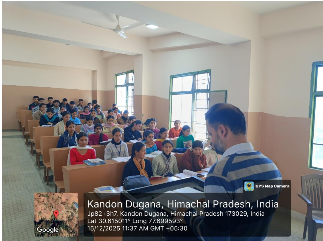
Figure 4: Lecture Hall 202 (Inside)