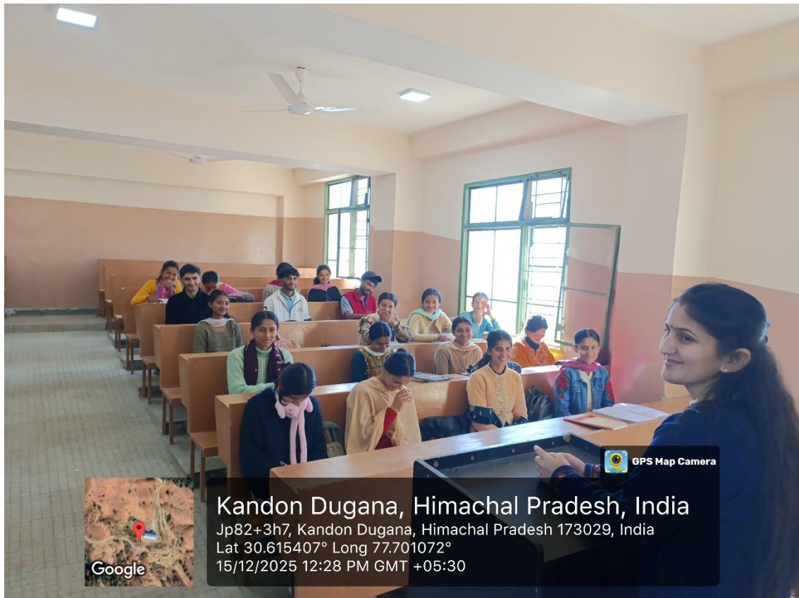
Figure 10: Lecture Hall 401 (Inside)