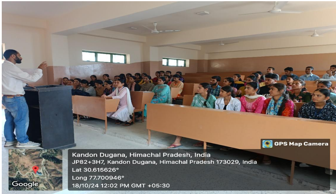
Figure 13: Room No. 402 (inside)