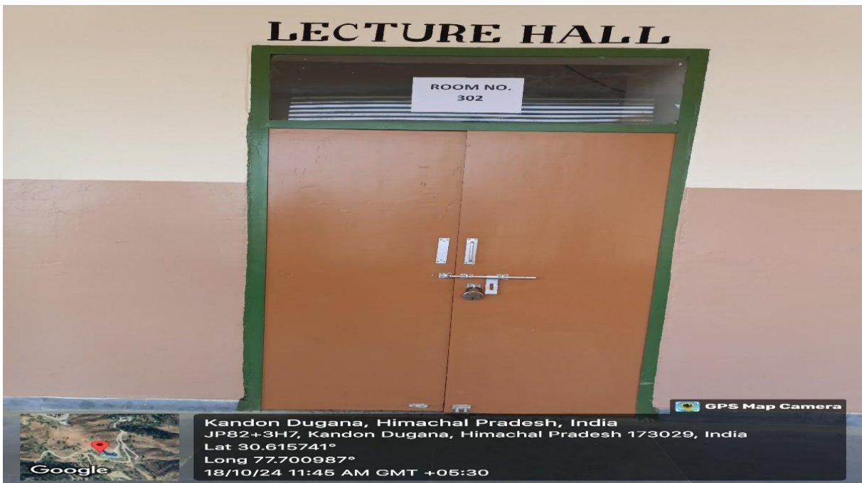
Figure 8: Room No 302 (outside)