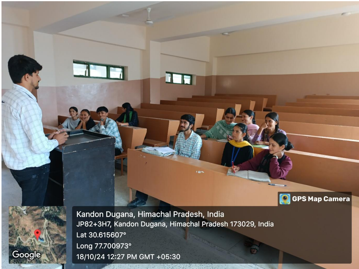
Figure 7: Room No 302 (inside)