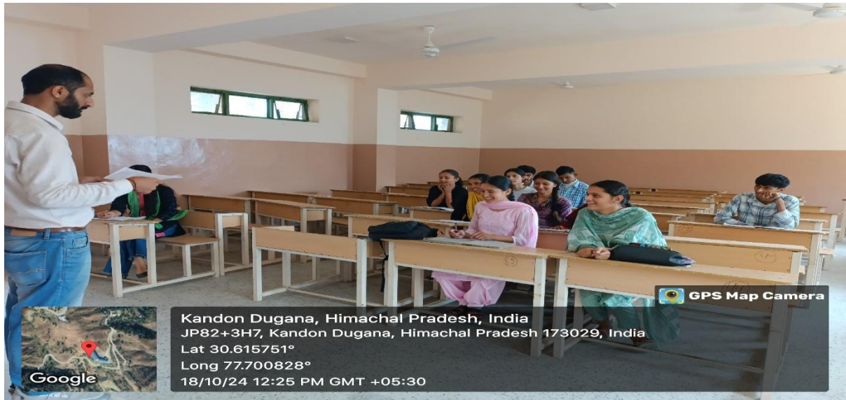
Figure 9: Room No 303 (inside)