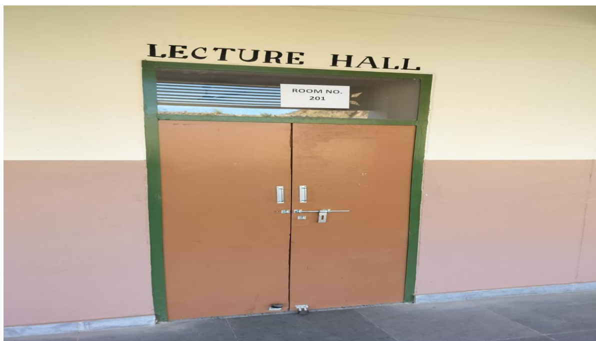
Figure 2: Room No. 201 (outside)