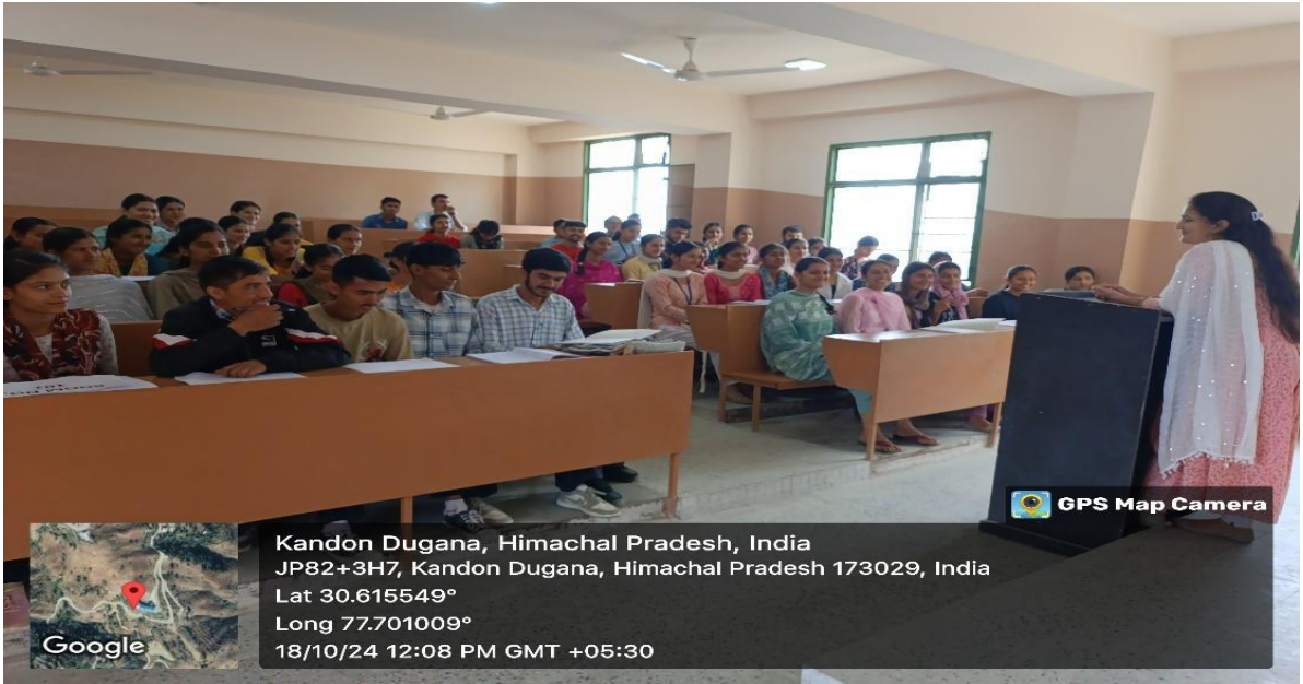
Figure 11: Room No 401 (inside)