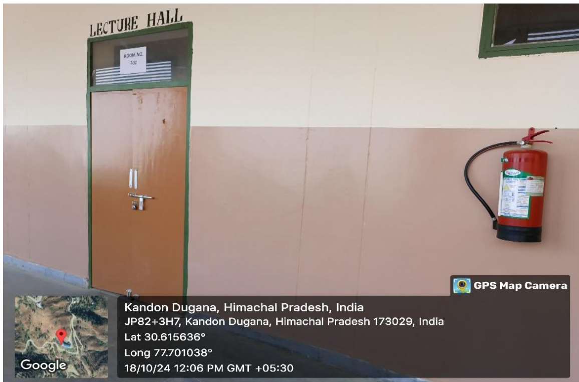
Figure 14: Room No. 402 (outside)