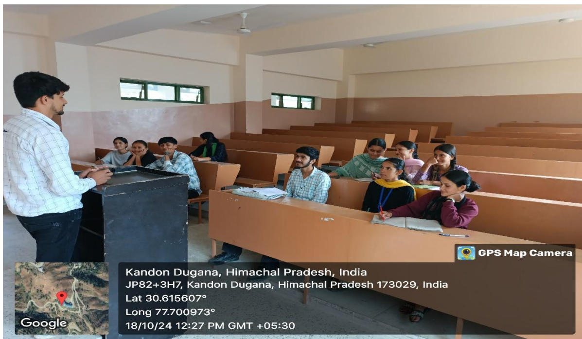
Figure 1: Room No. 201 (inside)