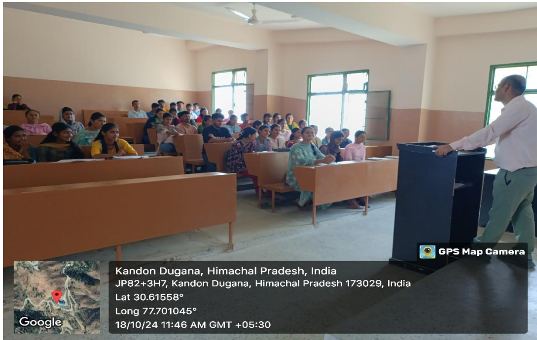
Figure 5: Room No. 301 (inside)