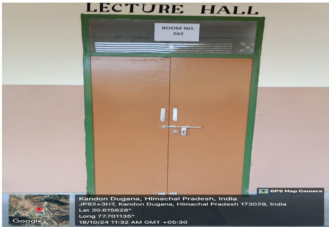
Figure 4: Room No. 202 (Outside)