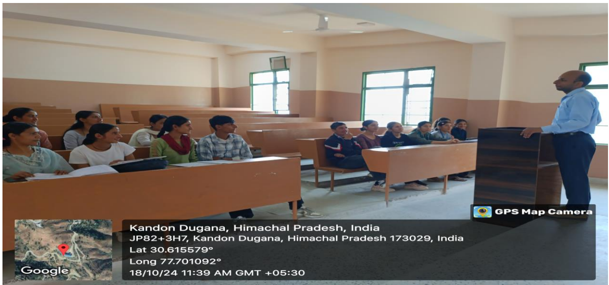
Figure 3: Room No. 202 (inside)