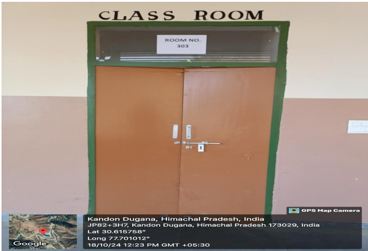
Figure 10: Room No. 303 (outside)