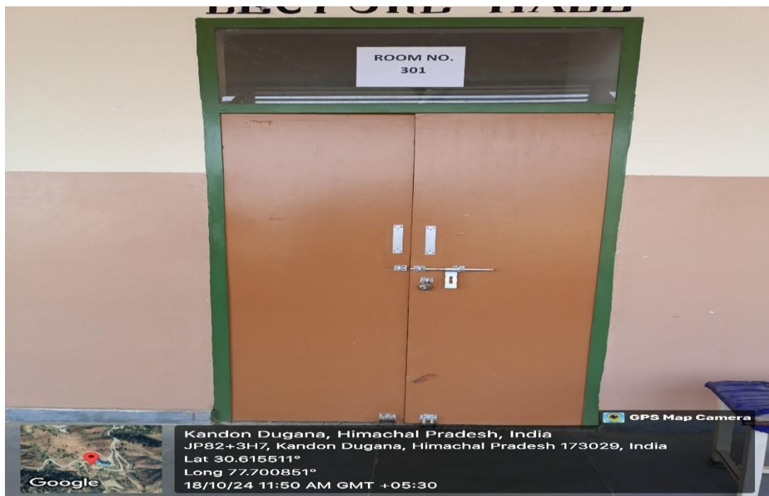
Figure 6: Room No. 301 (Outside)